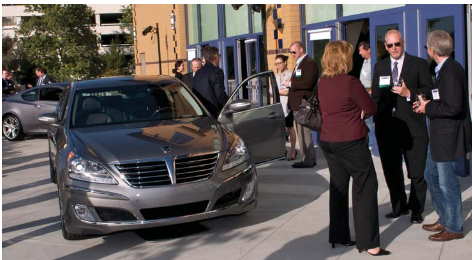
Guests gather to get a look at Hyundai's new luxury car Equus.